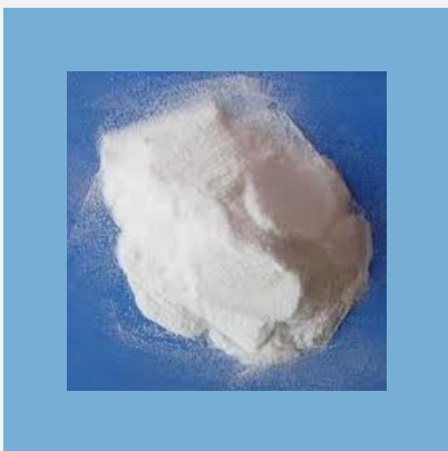
Potassium Magnesium Citrate