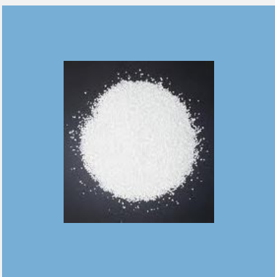
Sodium Citrate Anhydrous USP