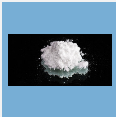
Di-Sodium Hydrogen Citrate